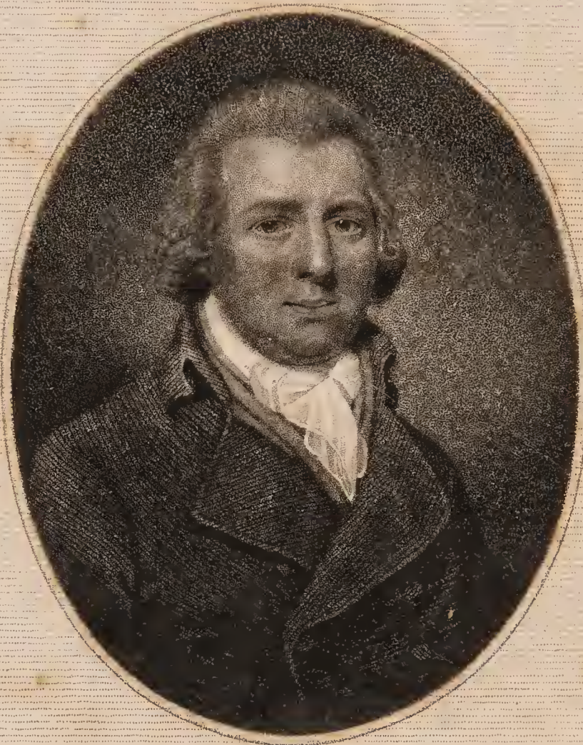
WILLIAM CURTIS AUTHOR OF THE FLORA LONDINENSIS BOTANICAL MAGAZINE &c.